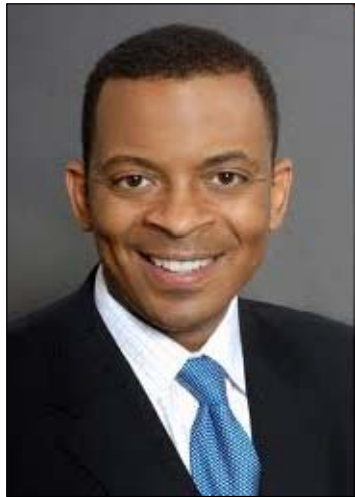
Anthony Foxx (D)