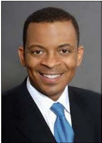
Anthony Foxx (D)